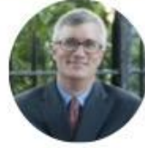
State Senator Brian Kavanagh